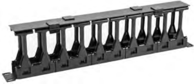
ERHCM-2 Same as above except 2U