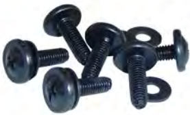
ER-RS1224-100 Same as above except 100 Pack