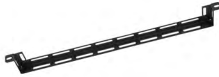
ERLBAR-10 Basic cable lacing bar (10 Pack)